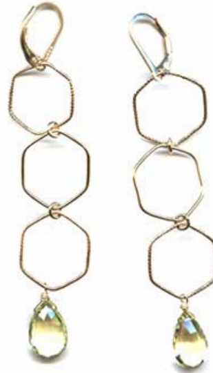
Lemon Citrine Earrings Retail $89 ea