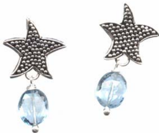
Aqua Starfish Earrings Retail $42