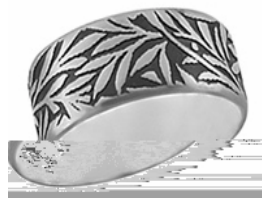
Willow Band Ring Retail $59