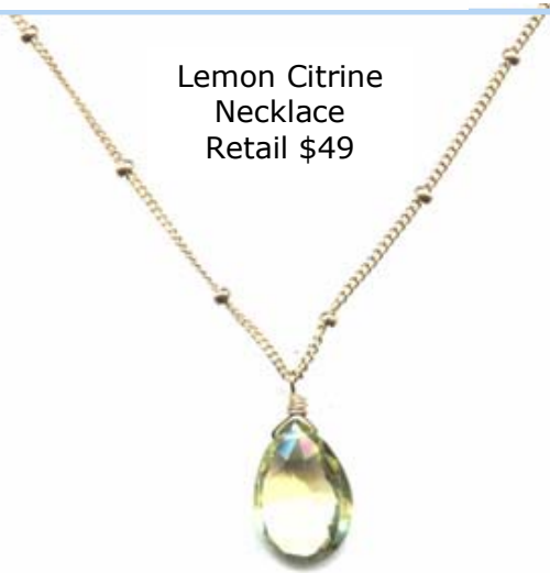
Lemon Citrine Necklace Retail $49