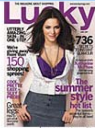
Lucky June 2007