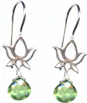
Water Lily Earrings Retail $59