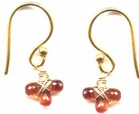
Sapphire Earrings Retail $110