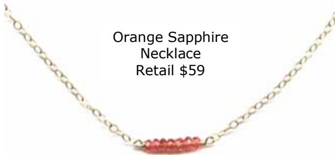
Orange Sapphire Necklace Retail $59