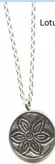
Lotus/Om Necklaces Retail $45