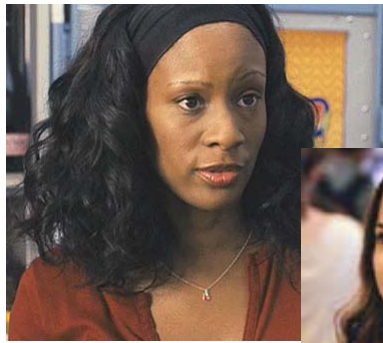
"Superbad" Sony Pictures