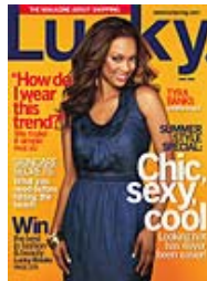
Lucky June 2006