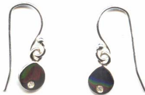
Diamond Tag Earrings Retail $89